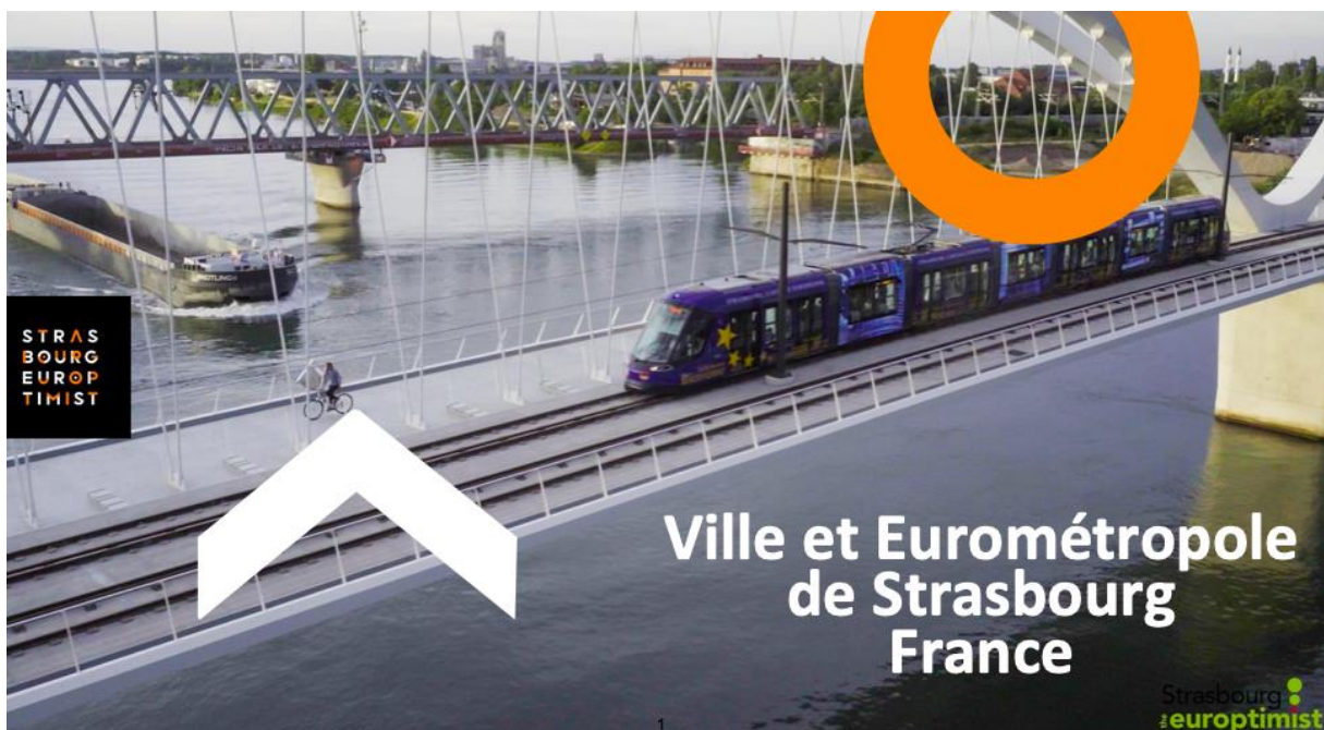
Photo 1. Caption from the presentation with the Eurometropole's logo: 'Europtimist'

Urban Policy: The Eurometropole actively engages in urban development and crime prevention strategies, making the region safer and more attractive for residents and visitors alike.