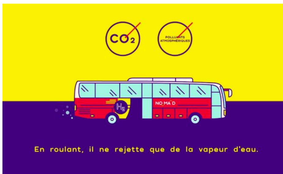
Photo 5. Nomad Car Hydrogen H2

https://www.youtube.com/watch?v=Ew0PiwEldIQ