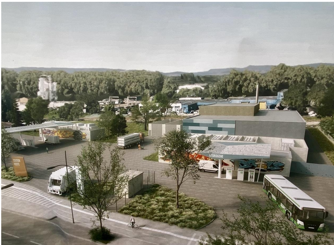
Photo 6. Photorealistic representation of the R-Hynoca station

The H2MA project is co-funded by the European Union through the Interreg Alpine Space programme