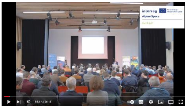
Hydrogen - An Opportunity for the Decarbonization of Alpine Territories

The complete conference was broadcasted as a Live-Stream on Youtube and remains available.