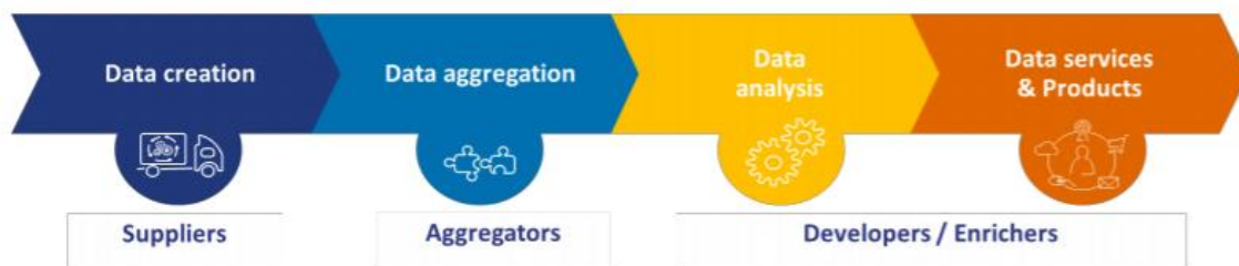
Figure 1: Open Data Value Chain

An essential value is to provide guidance for the interplay between the private and public sector in order to develop business opportunities from raw public data. While the public sector is responsible of providing Open Data, according to today's economic system the private sector is indispensable to create an added value of it on the on hand. On the other side, only an economic model enables the development of a sustainable service and therefore long-term value of the re-used Open Data. Alpine Space (AS) entrepreneurs will profit from the DEAS toolkit getting support in identification relevant LOD and their exploitation, in the development of customer-oriented products and its business model and in increasing their competitiveness and attraction.