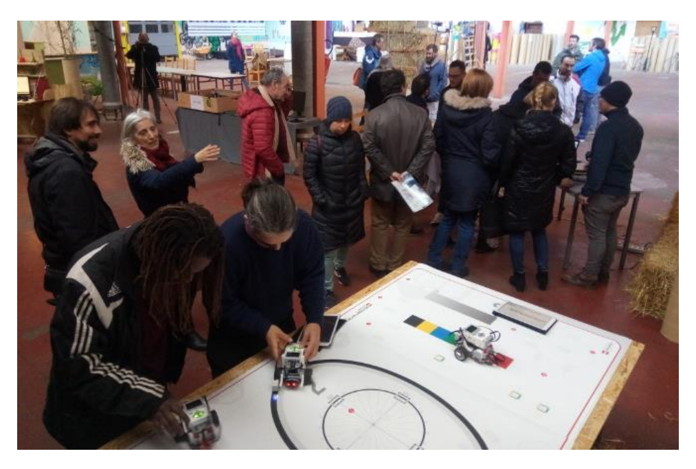
Figure 3. Visitors at the converted textile factory in Royans Vercors (SAB)