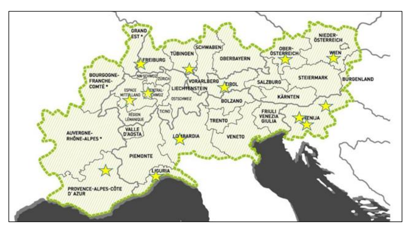
Figure 1. SmartVillages partners and test areas