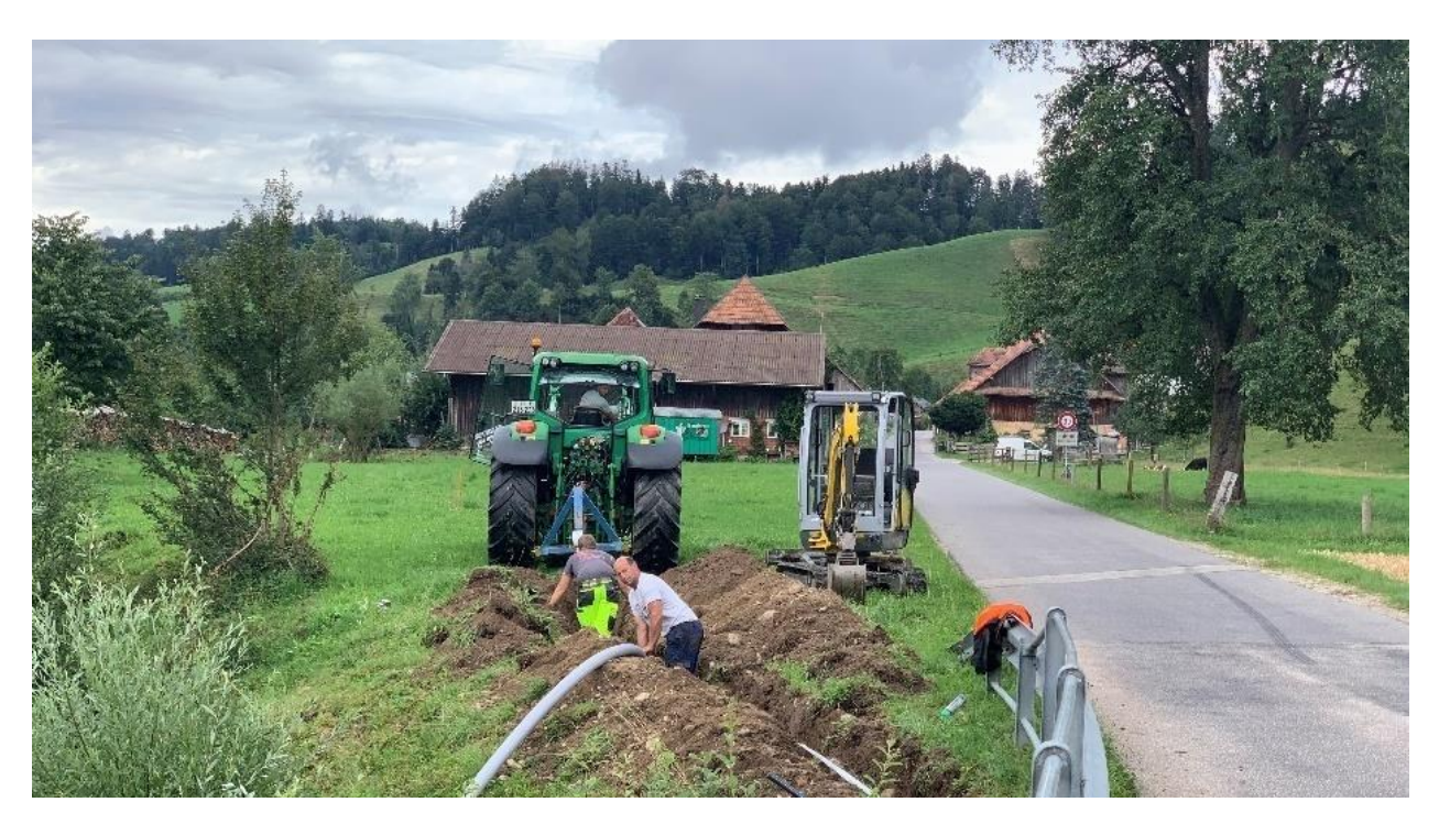
Figure 8. The local fibre optic network of Luthern being installed (RLW)