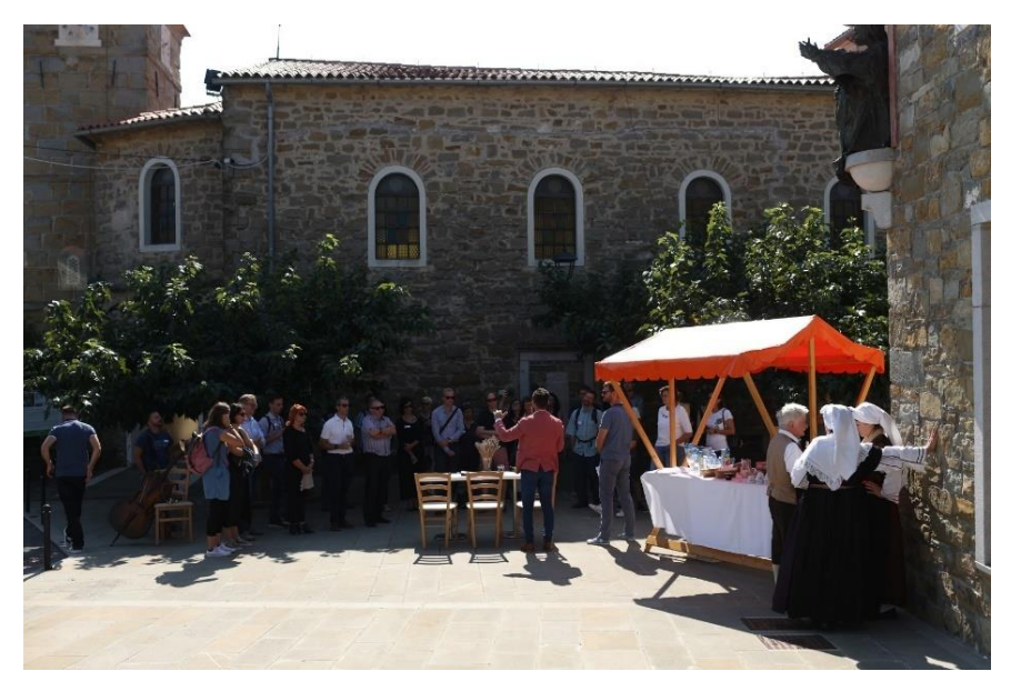
Figure 5. Marketplace of the municipality of Šmarje – Presentation of Wi-Fi access points for the promotion of local products (SAB).

At the beginning, the municipality of Šmarje was interested in the internet coverage in the village. Wi-Fi access points were installed at the market square, community centre building, the church and at a service station on the main road to the coast, where many tourists usually stop for a short break. After the installation of the Wi-Fi access points, several farm stays, without internet access due to geographical constraints (located in a valley), were able to communicate by email and to promote their services via their web pages and social media channels regularly. Moreover, they were able to use POS terminals for non-cash payments, which was not possible earlier. In addition, a mobile application was developed to promote local products and services. Whenever users request free Wi-Fi access from the local network, they agree to receive targeted promotions for local products and services, such as olive oil, wine or accommodation at local facilities.