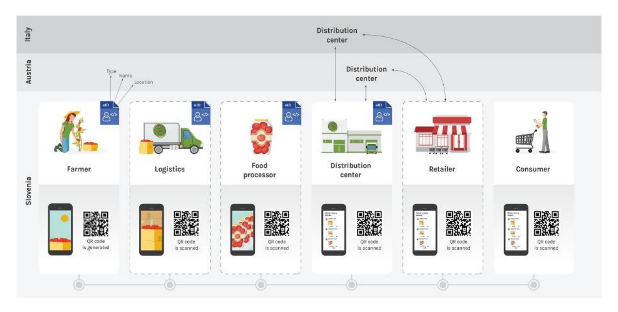
Figure 11. The short supply food chain using blockchain technology