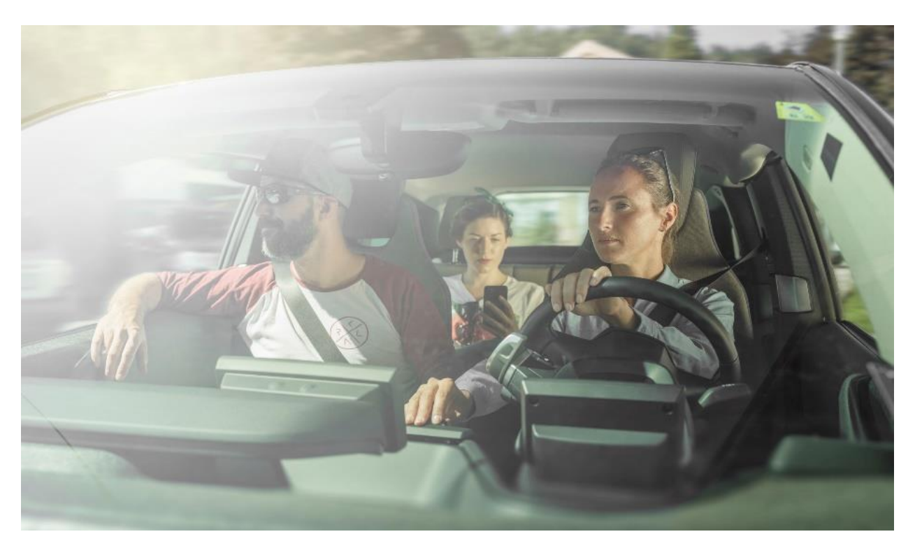
Figure 6. Ridesharing "Ummadum" (Ummadum)