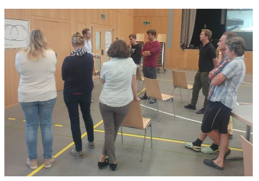
Figure 4. The core group members of the "coworking space Saas Fee" organise their community building work with the collaborative platform "crossiety" (SAB)

Collaborative platform Crossiety in Saas Fee (Upper Valais, Switzerland, PP SAB)